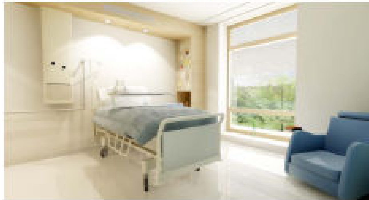
Figure 2 The therapeutic environment (acute bedroom shown)